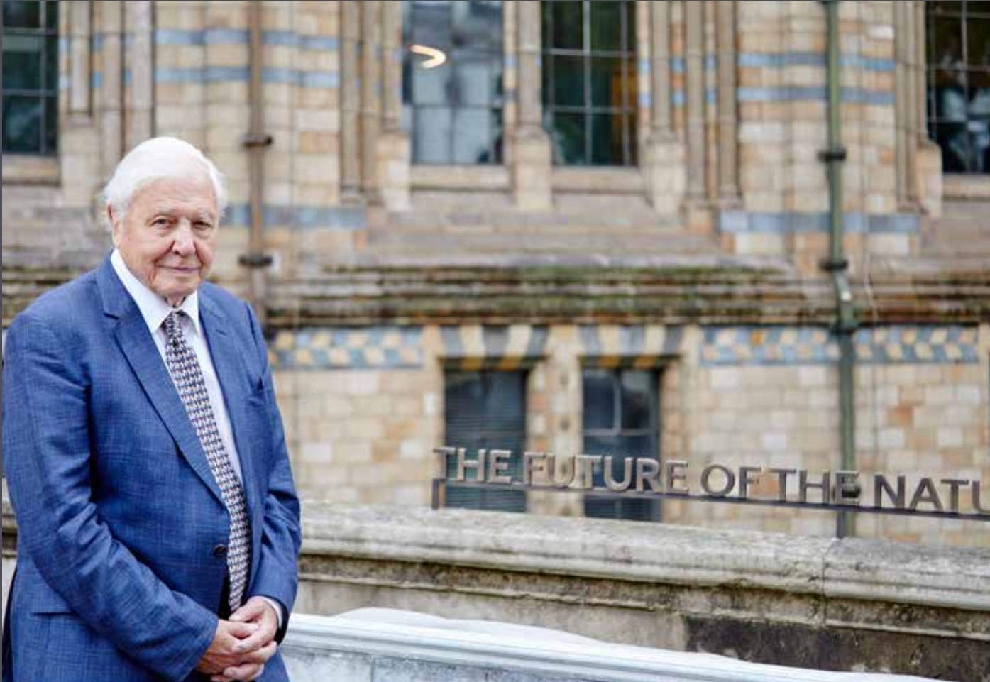
↑ Natural History Museum, London

Sir David Attenborough's compelling words, 'The future of the natural world, on which we all depend, is in our hands' were unveiled in bronze lettering outside the Museum's main entrance.