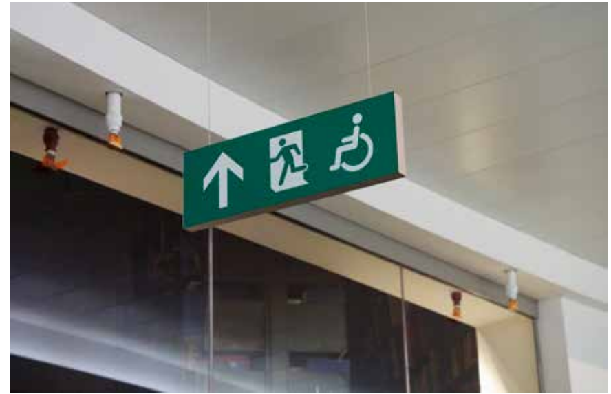
→ Bloomberg, London. Fire exit sign, symbols and level indicator cut from aluminium. This unusual Fire exit graphic requires Building Control approval.