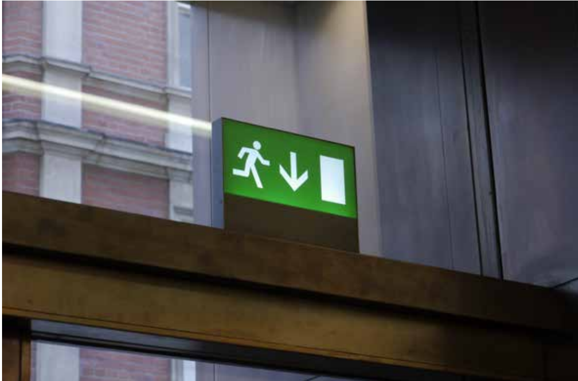
↑ Quadrant 3, London. An illuminated Fire exit sign developed for the Quadrant 3 building in Regent's Street. The sign housing has been made from bronze toned brass to match the metal finishes within the building.