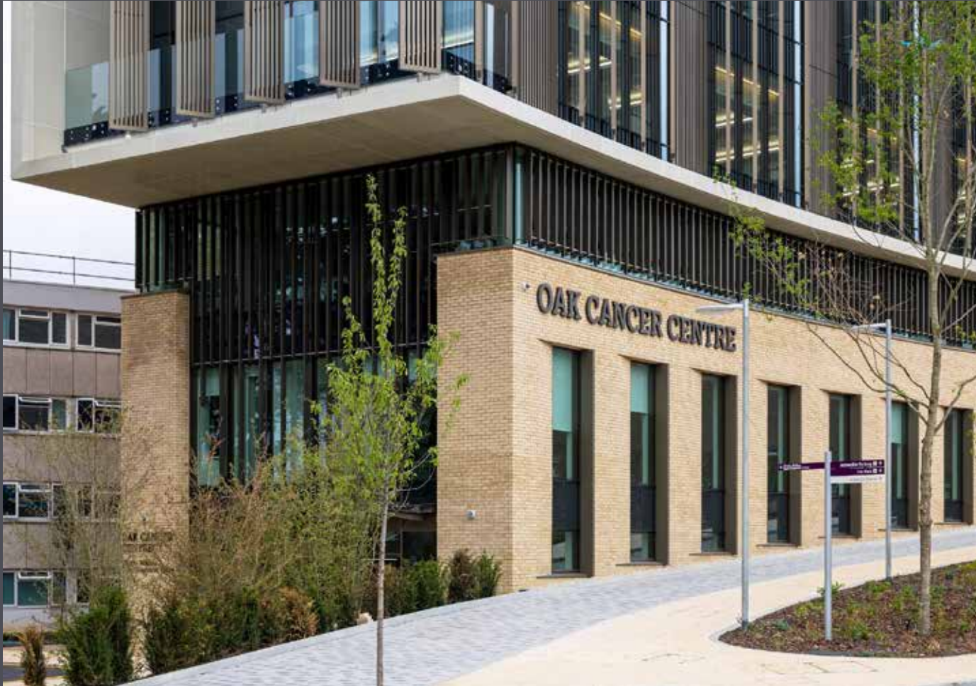
↑ Oak Cancer Centre, London

A new research and treatment facility, funded by The Royal Marsden Cancer Charity. All signs designed, manufactured and installed by Rivermeade.